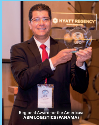
Regional Award for the Americas: ABM LOGISTICS (PANAMA)