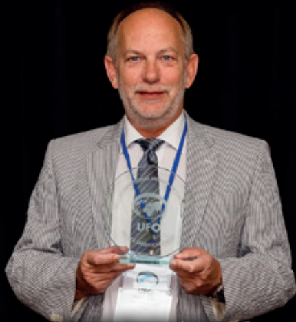
International Member of the Year: ALLSTA SPEDITION (GERMANY) [Not present at this year's event, photo from 2017]