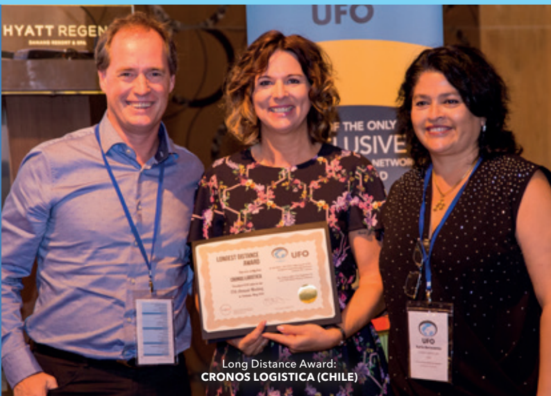
Long Distance Award: CRONOS LOGISTICA (CHILE)