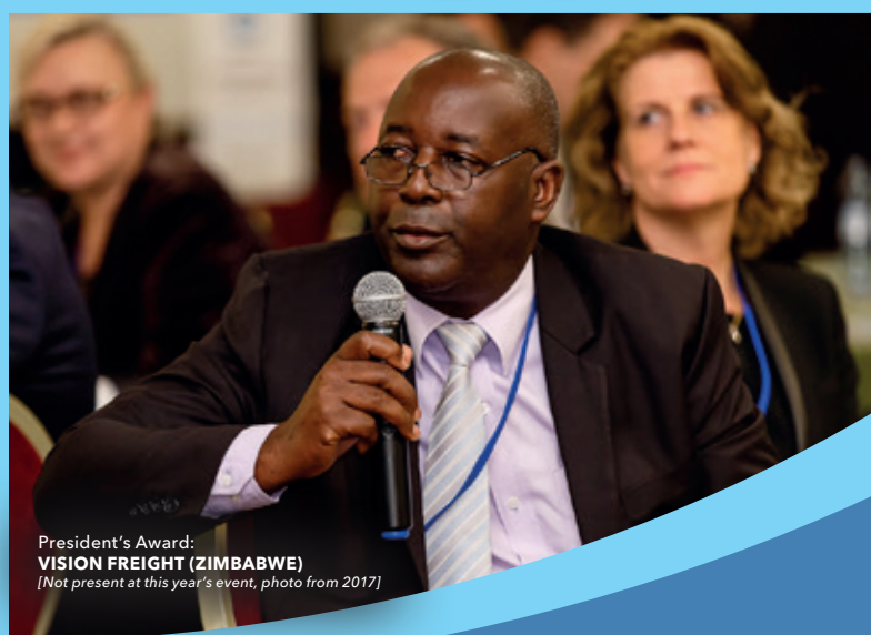
President's Award: VISION FREIGHT (ZIMBABWE) [Not present at this year's event, photo from 2017]