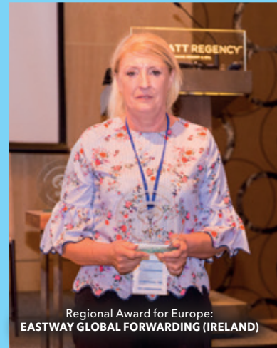
Regional Award for Europe: EASTWAY GLOBAL FORWARDING (IRELAND)