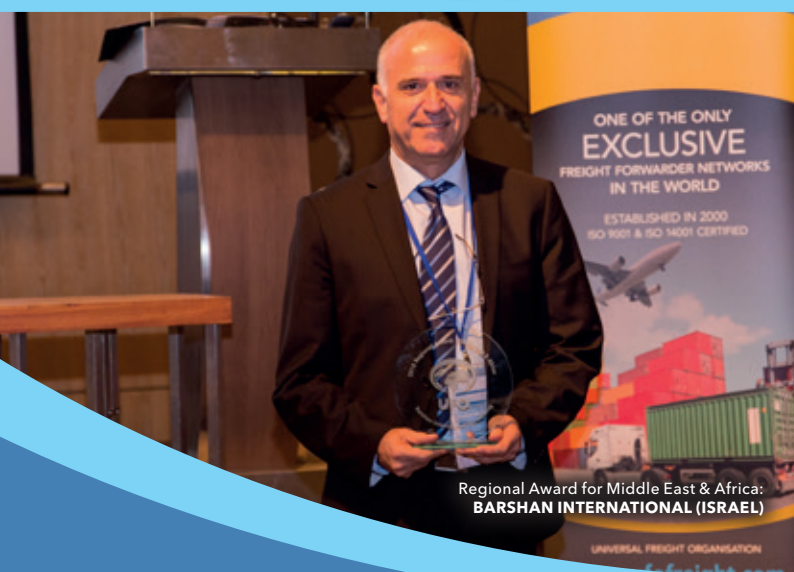
Regional Award for Middle East & Africa: BARSHAN INTERNATIONAL (ISRAEL)